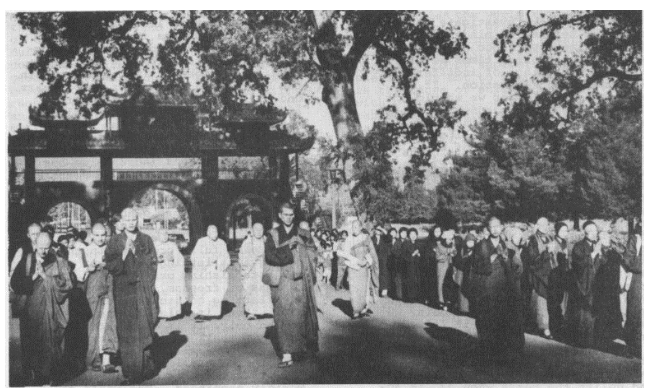
Procession from the Mountain Gate