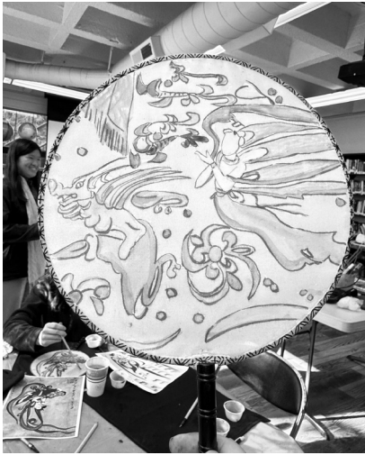
學生作品。Students' art work.