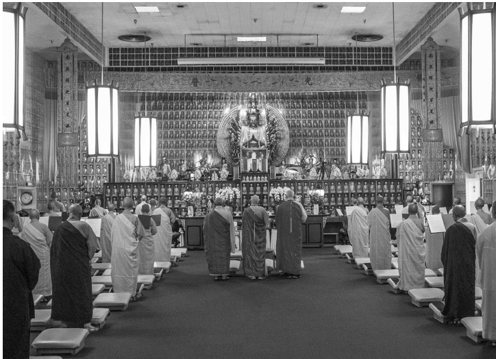
The repentance ritual before the transmission of the Bodhisattva Precepts were held in the Buddha Hall from 7:30 pm to 11:00 pm on July 14.