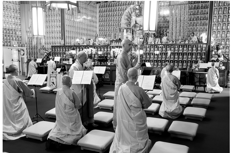
7月15日早上7點半在佛殿舉行菩薩戒傳戒儀式。 The transmission of the Bodhisattva Precepts began at 7:30 am on July 15.

集合，燃十二個菩薩戒香疤。因為菩薩戒所著重的是利益眾生，虛雲老和尚曾開示戒子們受菩薩戒應燃香疤。這個下午，戒子們也分享了各自的受戒心得。祝願戒子們受戒後各自能把戒律應用到生活中，並讓上人的家風代代相傳。