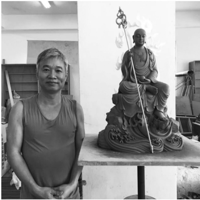
Clay model of wood carving at Sheng Kuang Sculpture Co. / December 2015