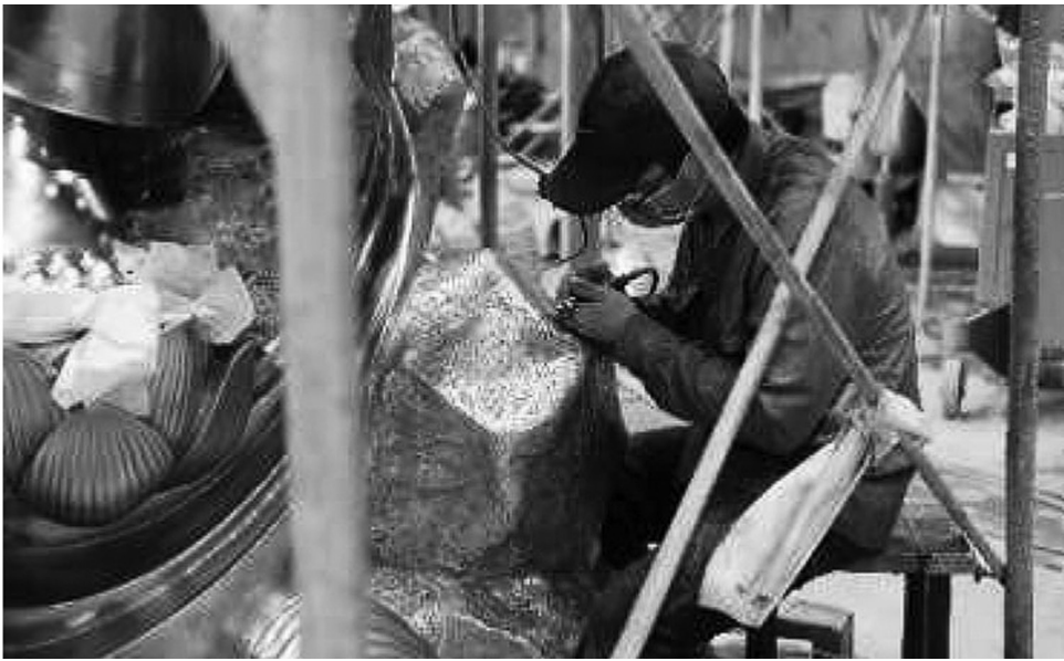
Work on polishing and finishing completed bronze casting / June 2017.