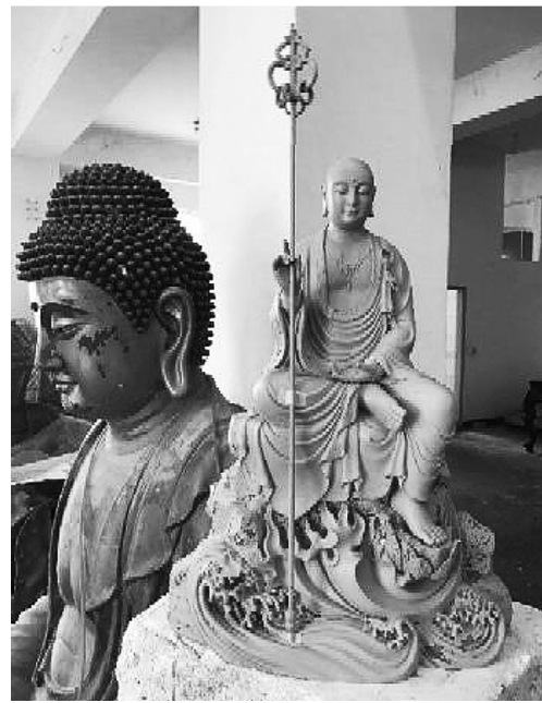
Fiberglass casting of clay figure / May 2016