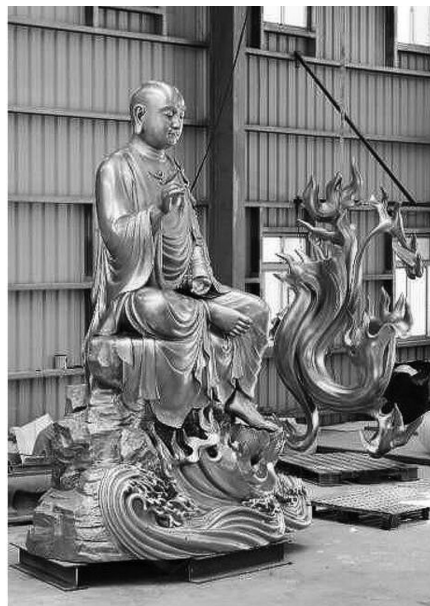
Completed and with freshly applied clear sealer / July 2017