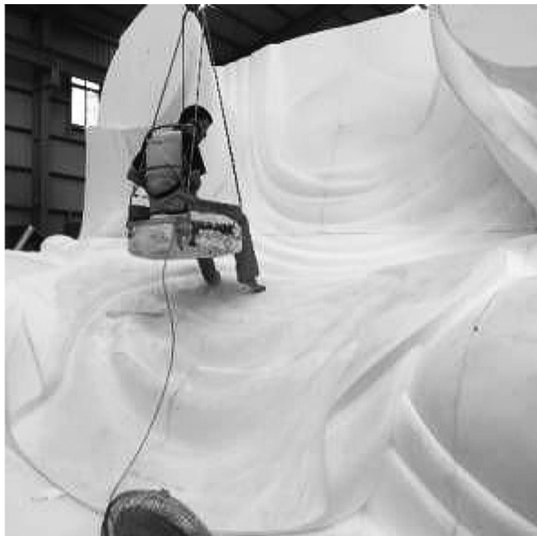
Full size Styrofoam model / December 2016. 等比例保麗龍塑像—2016年12月。