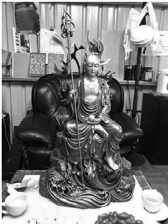
Painted fiberglass casting, two feet high / May 2016. 上色後2呎高玻璃纖維模具—2016年5月。

完成銅像鑄作成品的是位在台灣桃園的聖光雕塑有限公司。整個製作過程使這尊佛像變得更加細緻。這是一件美好