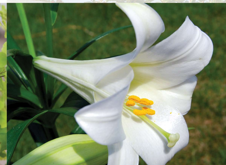
萱草花 YELLOW DAYLILY