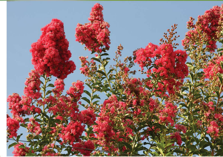
大帳篷 BIG TENT 紫薇 CRAPEMYRTLES