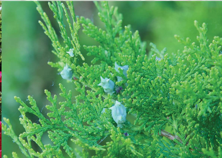
東方側柏 ORIENTAL ARBORVITAE 鐵線蕨 MAIDENHAIR FERNS