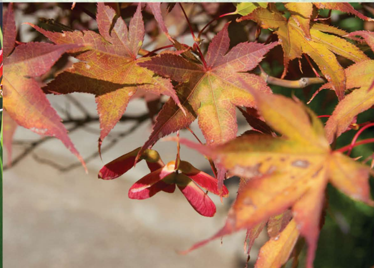
日本紅楓 JAPANESE MAPLE TREE