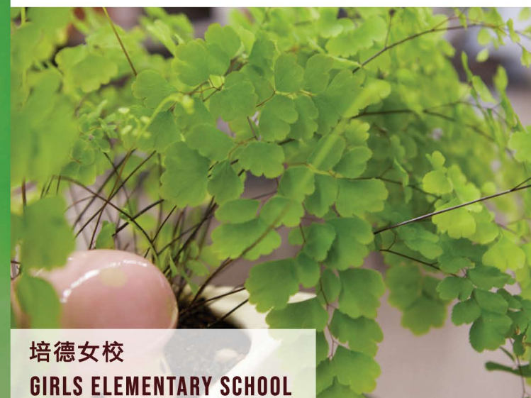
培德女校 GIRLS ELEMENTARY SCHOOL 鐵線蕨 MAIDENHAIR FERNS