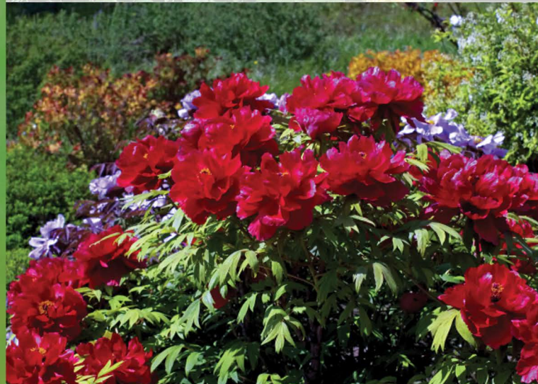
大殿 BUDDHA HALL 芍藥 HERBACEOUS PEONY