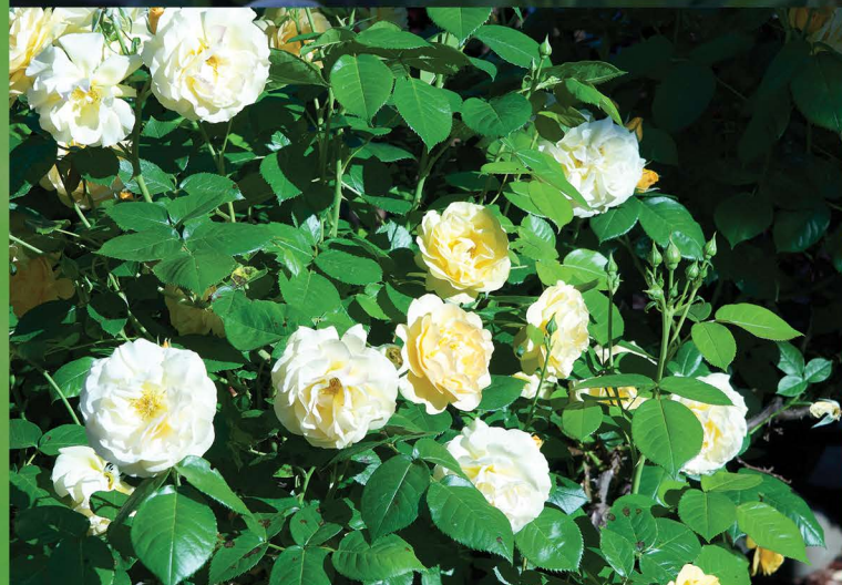
辦公室 ADMINISTRATION OFFICE