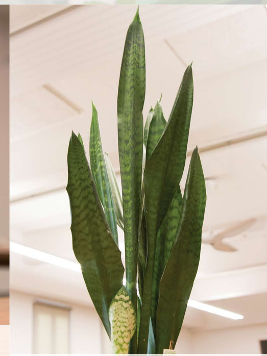
蛇蘭 SNAKE PLANT