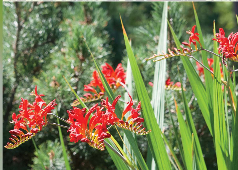
五觀堂 DINING HALL 火星花 COPPERTIPS