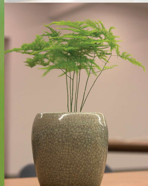
喜捨院 JOYOUS GIVING HOUSE 文竹 COMMON ASPARAGUS FERN