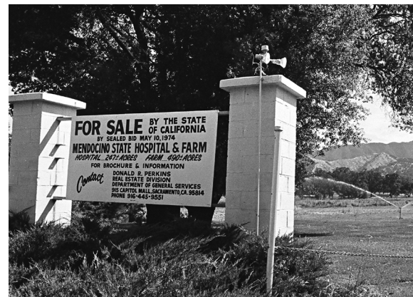
1974年曼德仙諾州立醫院及農場待售 Mendocino State Hospital and farm for sale in 1974

從一開始準備買萬佛聖城這塊地，到最後買下來，上人對是否太大或是太難照顧這些問題，從來沒有疑慮過。他一點都不害怕，也知道會有些弟子反對買萬佛聖城的主意，但是他都是說：「哦，不用擔心！這個地方將是佛教的未來。」阿彌陀佛！ ❀