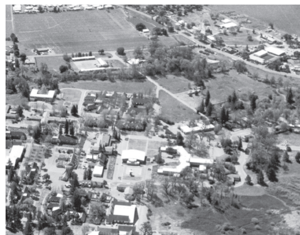
萬佛城俯瞰 CTTB-Aerial View