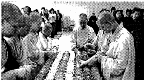
封背 BACK COVER