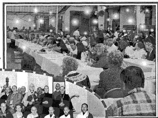
2002年僧伽會議與敬老節留影 Scenes from the 2002 Western Buddhist Monastic Conference and Honoring Elders Day at the City of Ten Thousand Buddhas