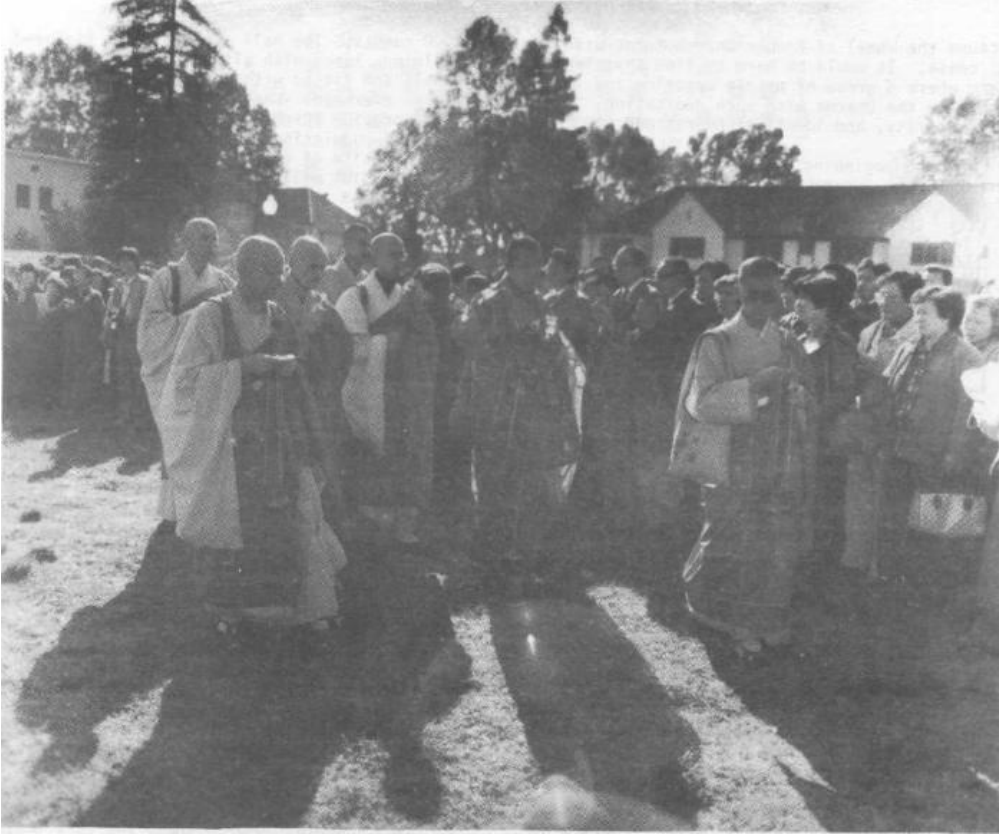
Tathagata Monastery Abbot and Bhikshus shown in the solemn ceremony of purifying the boundaries at the site of the proposed JEWELLED HALL OF GREAT HEROES during opening festivities in November.

After five years of hard work and preparation, the completion of the Hall of Ten Thousand Buddhas stands as awesome testimony of the pious prayers of Buddhists the world over. While offering their supplication for peace and an end to all nuclear weaponry and expressing their hopes for a new spiritual awakening for humankind, people the world over have reverently invited ten thousand Buddhas to reside in the hall. Now, ten thousand Buddha statues do indeed line the four walls of the Hall. The Hall is further adorned with streamers, banners, lamps, and a new altar, and graced in the center by the presence of an eighteen-foot high statue of the Thousand-Handed, Thousand-Eyed Kuan Yin Bodhisattva. The ten thousand Buddhas have been sponsored by Buddhist disciples the world over who by thus inviting the Buddhas to the Hall have expressed their abiding faith in the importance of Buddhism to the future of world peace.